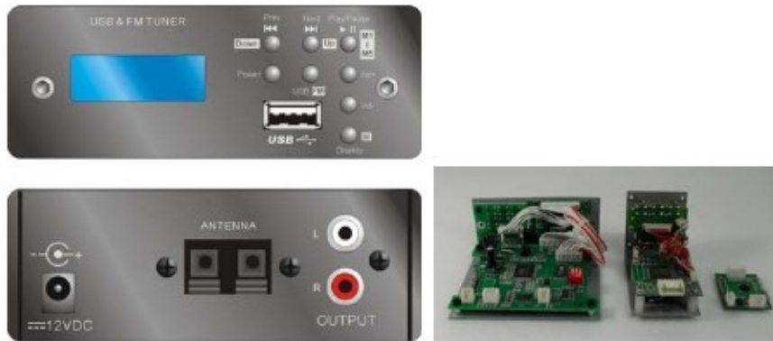
本機內部 同業 A 同業 B